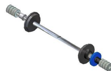
Optional Supply Roll Shaft